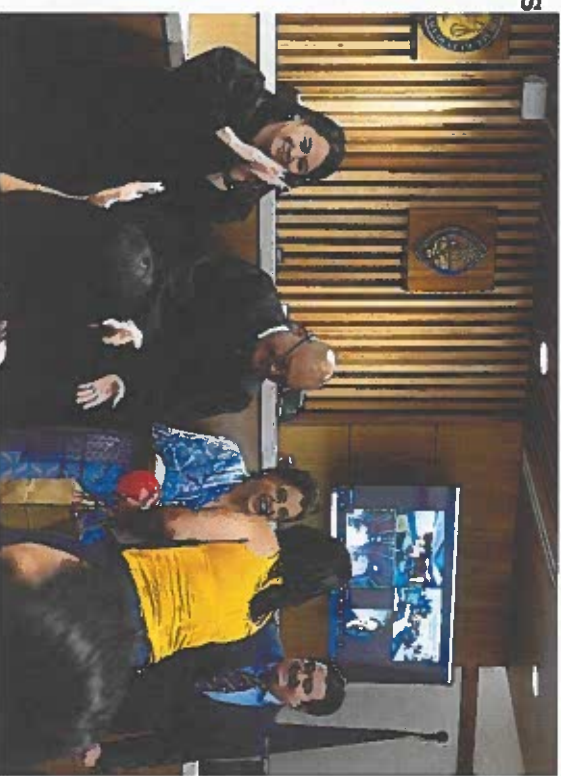
Adult Drug Court I & II Combined Graduation Ceremony (May 9, 2024)