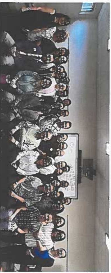
National Association of Drug Court Professionals (NADCP) Training (March 13, 2023)