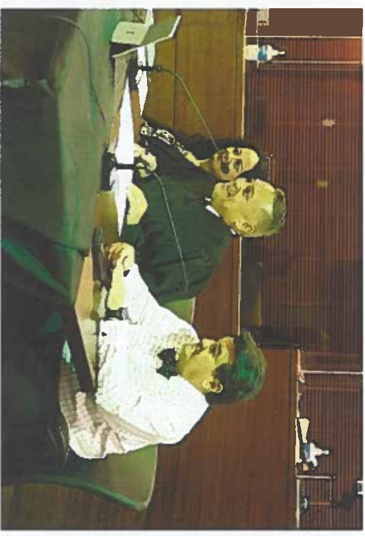
Guam Adult Reentry Court Graduation Ceremony (February 29, 2024)