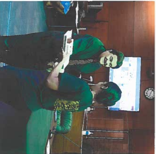
Driving While Intoxicated Treatment Graduation Ceremony (June 20, 2024)

The Driving While Impaired Treatment Court serves eligible defendants charged with Driving While Impaired and Driving Under the Influence Offenses.