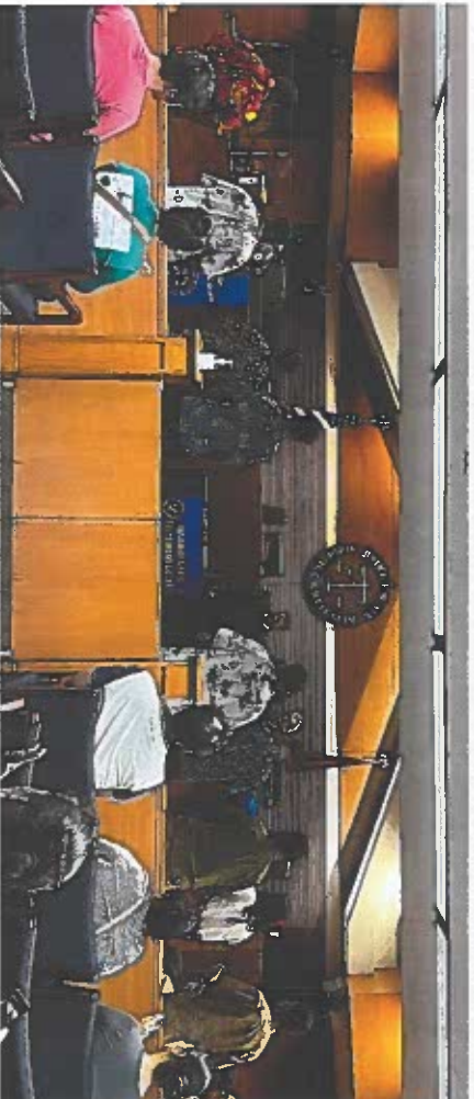
Juvenile Drug Treatment Court Graduation Ceremony (March 23, 2023)

The Juvenile Drug Court (JDC) involves juvenile cases with a drug or alcohol offense.