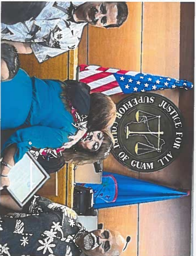
Guam Family Recovery Program Graduation Ceremony (November 17, 2023)

The Guam Family Recovery Program aims to promote the health, safety, and welfare of children from abuse and neglect where parental substance misuse is a factor.